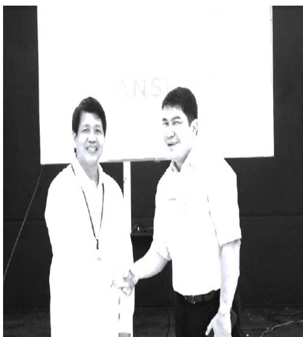
Outgoing Department of Social Welfare and Development (DSWD) Secretary Rolando Joselito D. Bautista congratulates incoming Secretary Erwin T. Tulfo during the transition briefing for the incoming DSWD management.

In line with the upcoming change in leadership at the Department of Social Welfare and Development (DSWD), outgoing Secretary Rolando Joselito D. Bautista met with incoming Secretary Erwin T. Tulfo and his team on June 6 for a briefing on the Department's landscape and organizational structure, major programs and services, accomplishments and key milestones as well as the propositions for the incoming Secretary.